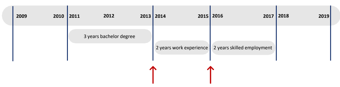
3 years bachelor completed skills level requirement met date