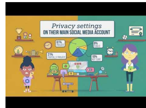
Video Source: Australian Government, Office of the Children's esafety Commissioner

This video is a collection of research data that looks into the use of social media. It focusses on how children interact with social media. This video was produced in 2017.